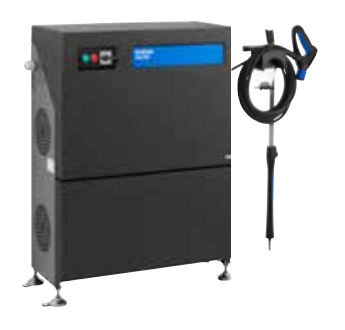
Accessory storage kit.