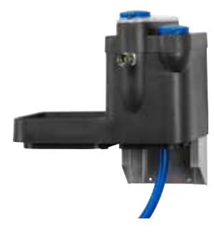
External Water Break Tank for op til 40 ltr/min.