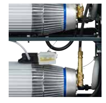
Pump oil tank with oil level sight.