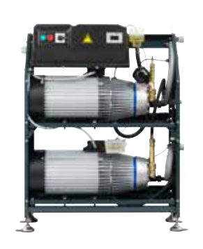
Cabinet can be removed quickly for direct access to the motor pump.