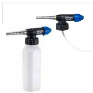
The FoamSprayer technology allows a simple and efficient application of detergent.