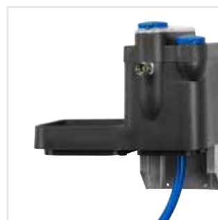
External Water Break Tank for oil til 40 ltr/min.