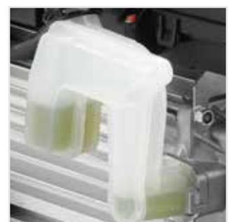
Pump oil tank with oil level sight and fill/empty function.