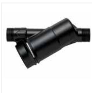
BA valve (Back flow preventer).