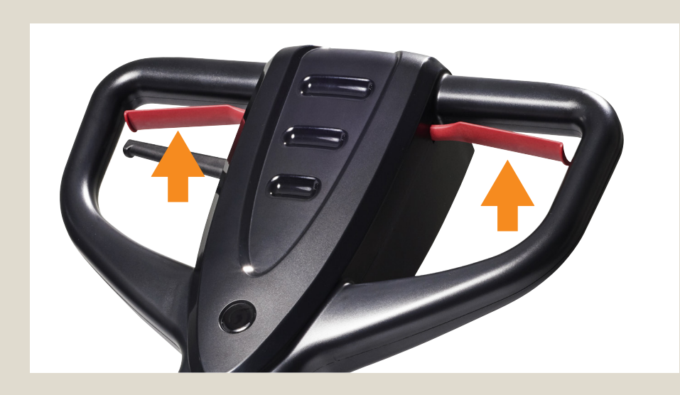
Start cleaning by placing the hands on the safety switches