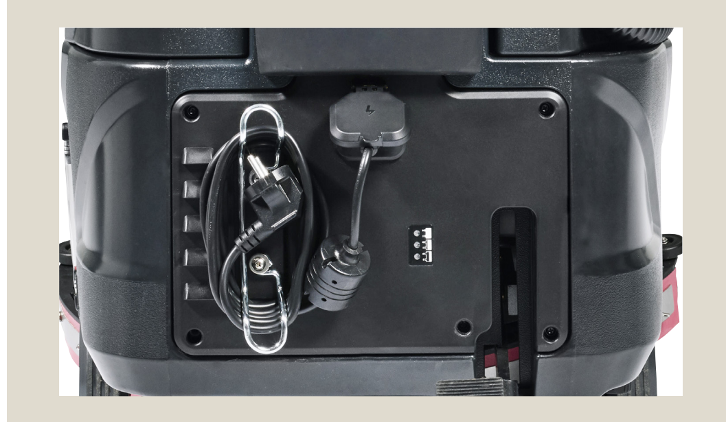
Daily: Charge the batteries: Connect the battery charger cable to the electrical socket. Light turns red when charging and green when the charging is complete.