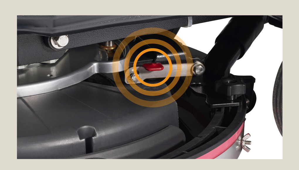
Lift the squeegee up by hand until it locks in up position and turn suction off for double scrubbing. To go back to working mode, use the red lever to release the squeegee. and turn suction on again.