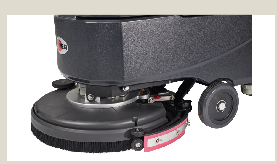
Place the brush or the pad-holder under the deck and Lower the deck or the brush/pad-holder by pressing the pedal