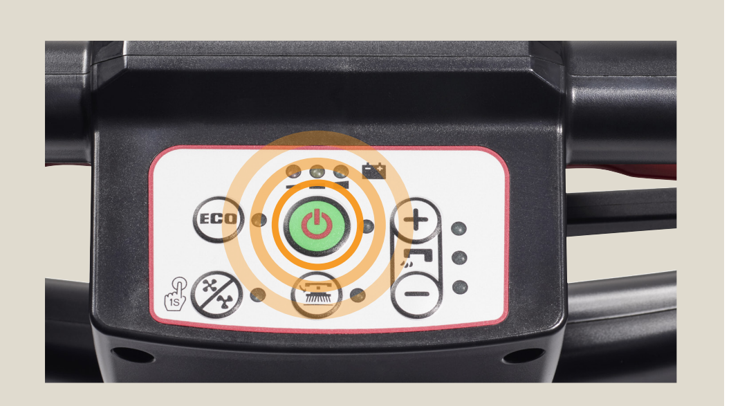
Turn on the machine and verify there is enough battery power to complete the work. Charge batteries if required.