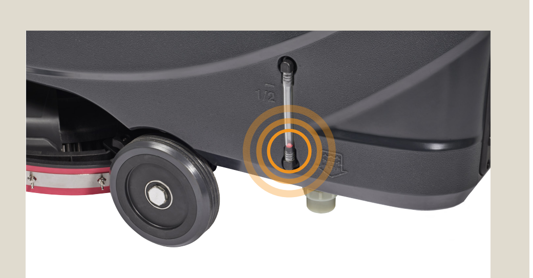
Check the solution level the red ball on the left side of the machine.

Remove the red cover, fill the tank with clean water and use maximum temperature 40 degree. Add appropriate low foaming detergent according to dosage information.