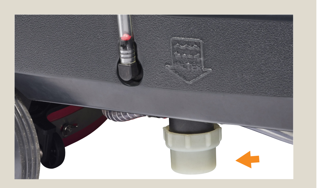
Weekly: Inspect the solution filter and clean if required.