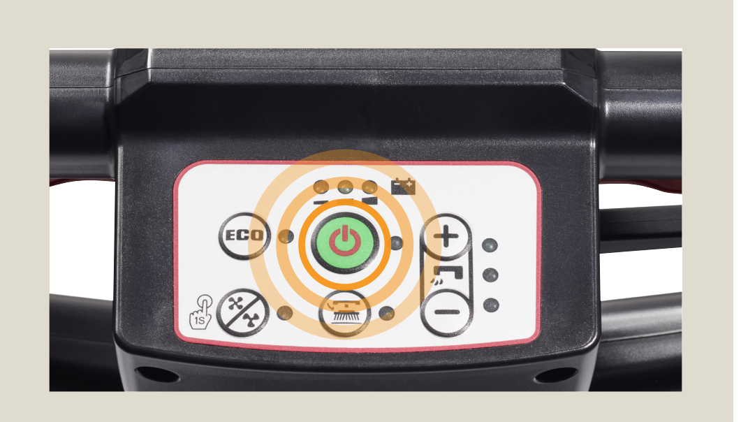
When scrubbing is complete, turn off the machine to perform the following maintenance