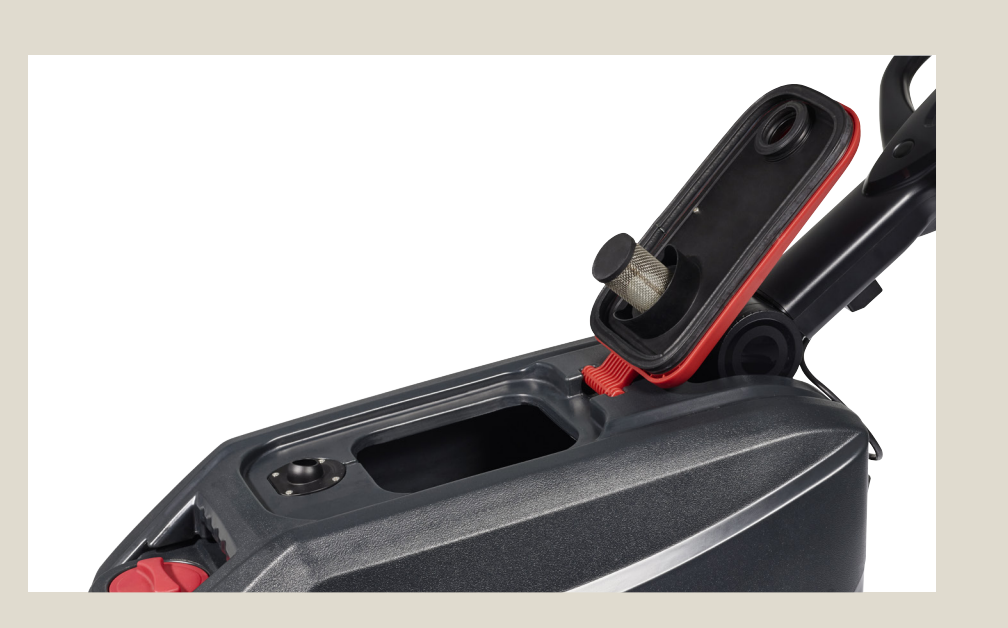
Daily: Leave the recovery tank lid open to let the tank dry after it's been cleaned to avoid bad odor.