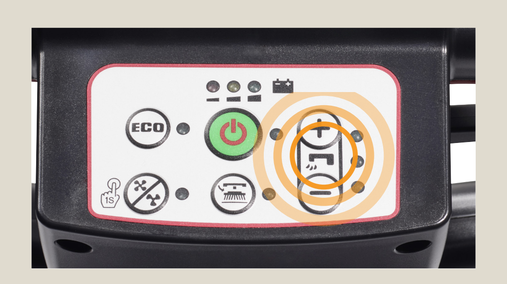
Press the + or – buttons to increase / decrease the solution flow rate.