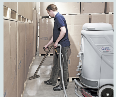
This compact machine offers a high level of productivity and efficiency in large industrial areas