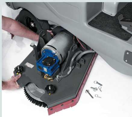
The QuickChange™ deck system is interchangeable without tools