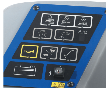
Easy access to all key components facilitates service and maintenance