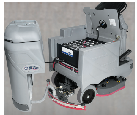
Easy to use control panel