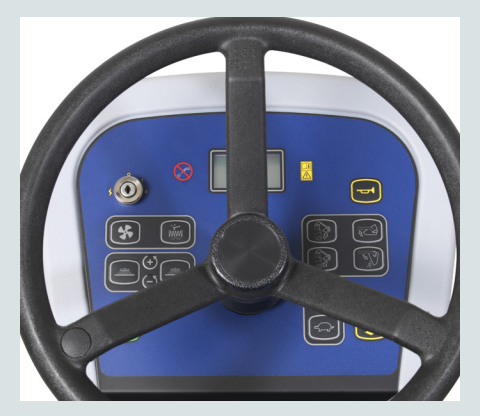
Control panel with icon buttons and modern display to reach best in class ease of use