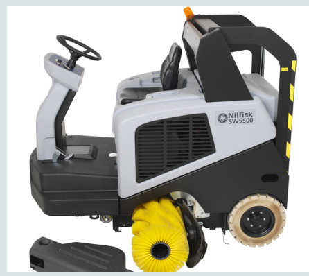
Fast and easy replacement of main components to make it easy daily operations and reduce downtime