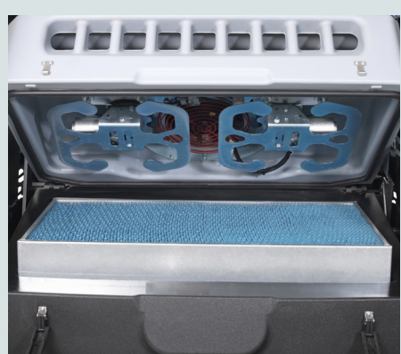
Multi-frequency timed filter shaker cleans efficiently the filter